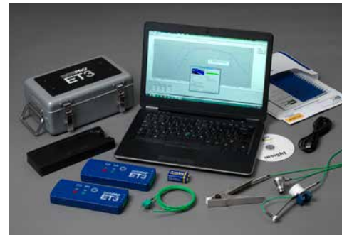
DATAPAQ EasyTrack3 system