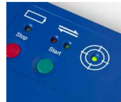
DATAPAQ ET3 SmartPac*