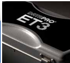
Thermal barrier DATAPAQ TB0263*