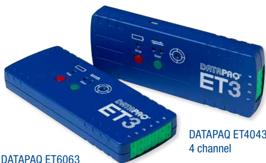
DATAPAQ ET6063 6 channel