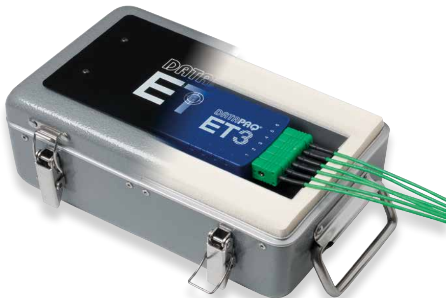
DATAPAQ EasyTrack3 system with standard TB0253 thermal barrier