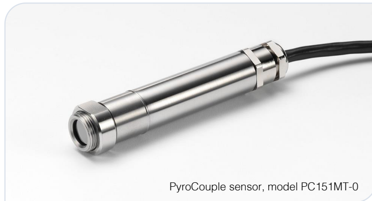
PyroCouple sensor, model PC151MT-0

Two model PC151MT-0 sensors are mounted on the paver and aimed at the road surface, before and after laying the tarmac. A sensor can also be placed on the roller to monitor the tarmac temperature immediately before it is compacted.