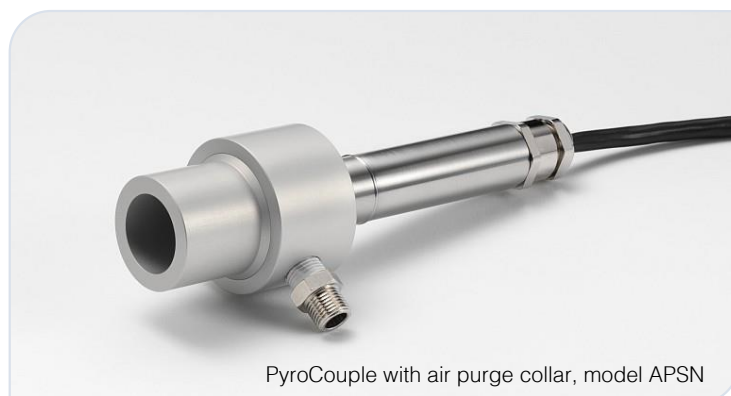
PyroCouple with air purge collar, model APSN