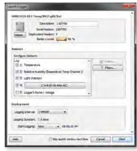
Easy logger setup - select launch parameters and go!

Data assistants – Data Assistants are tools to simplify data analysis specific to your application. Data Assistants are included with HOBOware Pro, such as Conductivity, Barometric Compensation, Linear Scaling, Pulse Scaling, kWh Assistant, Growing Degree Days, and Grains Per Pound.