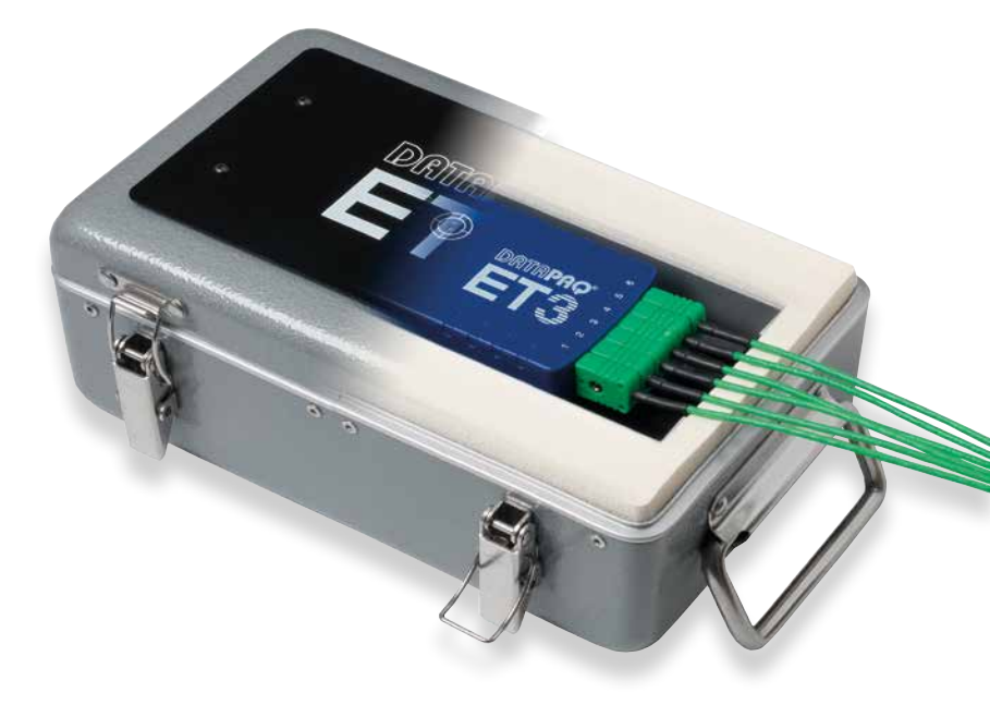
Thermal barrier DATAPAQ TB0263*

DATAPAQ EasyTrack3 system with standard TB0253 thermal barrier