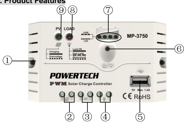
Figure 1 Product Feature