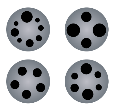
Customized Equalizing Block....Part No. EQ1