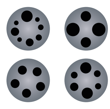
Customized Equalizing Block....Part No. EQ1