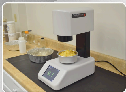
Low fat potato chips