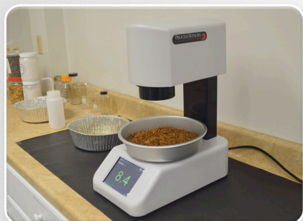
Moisture in tobacco