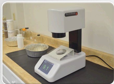
Clear film thickness