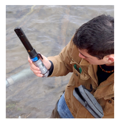
Offloading data to a waterproof data shuttle