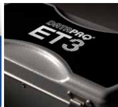
Thermal barrier DATAPAQ TB0263*