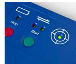
DATAPAQ ET3 SmartPaq*