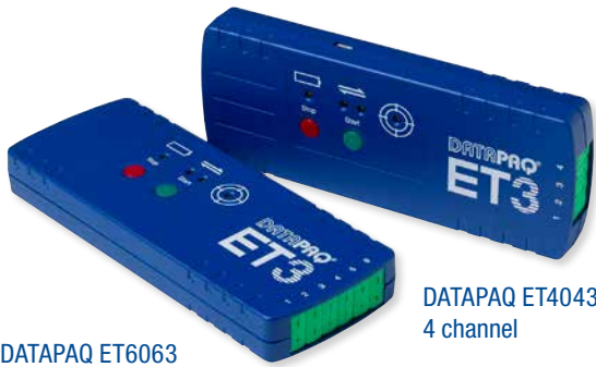
DATAPAQ ET6063 6 channel