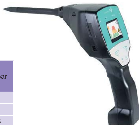
LD 400 with focus tube and focus tip for precise locating