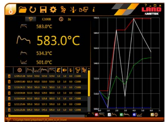
Measurement screen with instant temperature, a table view with list of recent measurements, plus a trend view of the same readings.