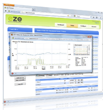
Real time web interface