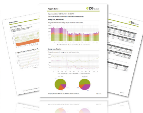
Automatic PDF reports