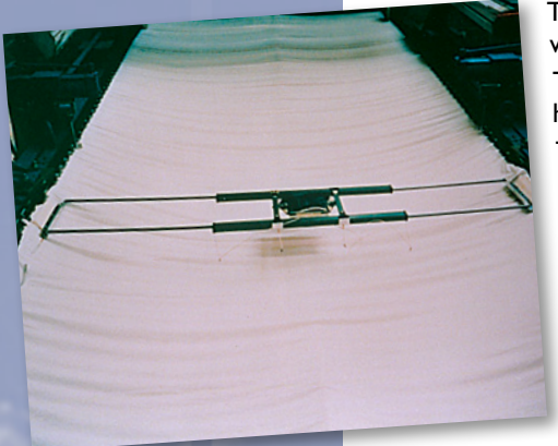
Telescopic Frame StenterPaq

Upon exit, the data is downloaded onto the Datapaq powerful, yet easy to use Insight ^{\text{m}} analysis software package, allowing fast and accurate analysis of the drying or curing cycle, with full color reports generated in seconds.