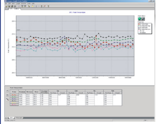
Step 3 Display SPC chart and SPC data

Select the USL, LSL and target value against which the results data is displayed graphically and from which the SPC calculations are performed.