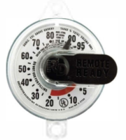
R3D LP Dial Jr. Tab