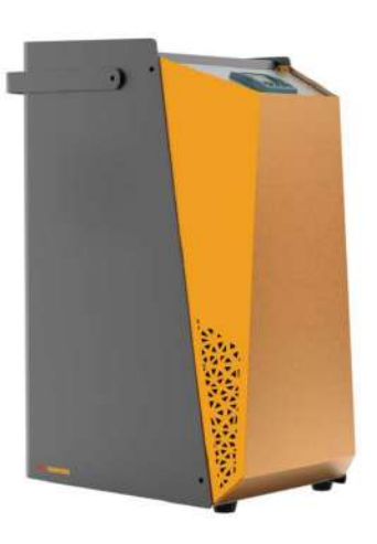
CALsys 1200 Autocal