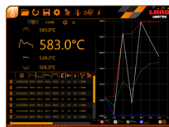
The Table View showing Instantaneous, Valley, Average and Peak, plus the unique Meltmaster temperature (on the 055L model) readings.

The Trend View displays Peak, Instantaneous, Average and Valley temperatures, Logger settings, Route Manager, Background Correction plus Timed Logging (taking measurements at pre-defined intervals between 1 and 60 secs).