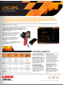
CYCLOPS LOGGER SOFTWARE

SEE OUR OTHER RELATED LITERATURE FOR THE CYCLOPS L: